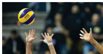
Catching a ball in sports is a common cause of volar plate injury

The most common causes of volar plate injuries are sports or falls when the finger is bent back forcefully. The volar plate can also be injured if the PIP joint is dislocated.