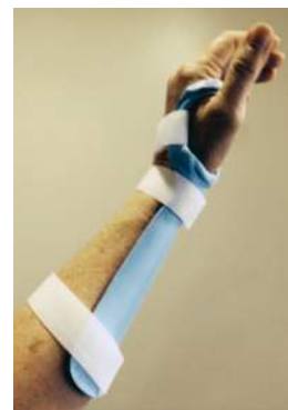
Orthosis for tennis elbow to help rest the affected area.

A hand therapist can provide conservative management for the treatment of tennis elbow, with the goal to return the patient back to normal work, home and sports activities. A therapist can help identify what activities might aggravate symptoms, and discuss activity modifications. A custom-fabricated brace or orthosis for the wrist might be recommended to rest the area. Various treatments can be utilized, such as heat, ice, ultrasound, massage or electrical stimulation. The therapist will often prescribe stretching and strengthening exercises. Following any surgery for tennis elbow, therapy is important to regain motion and strength.