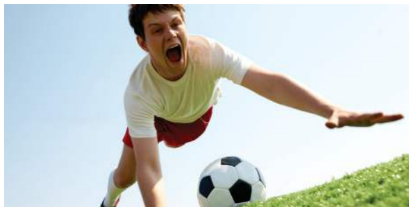
Example of a fall causing a shoulder dislocation

Shoulder dislocations can occur from repetitive trauma, an injury or accident. Dislocations occur when the shoulder is forced out of place from falls or sports injuries.