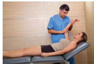
A hand therapist treats the hand and upper extremity, including the shoulder

To confirm the severity of the dislocation, X-rays may be ordered by a healthcare professional. It is important to immobilize the shoulder after the dislocation. Therapy may also be started after a brief period of immobilization. If dislocation occurs regularly and pain affects daily function, surgery may be recommended.