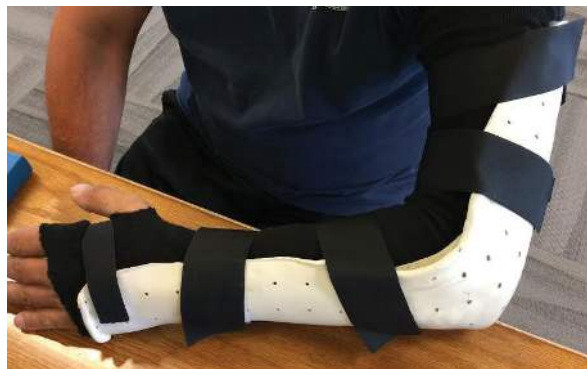
Example of a custom elbow orthosis for a radial head fracture

A hand therapist works directly with a doctor to assist with treating a radial head fracture. A custom orthosis to support and protect the elbow may be made. The therapist will also educate the patient on how to reduce swelling, decrease pain and regain motion and strength of the elbow, wrist and hand.