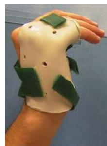
Custom-made orthosis for a hand fracture

A hand therapist is extremely important in the rehabilitation of hand fractures. The therapist can fabricate a custom orthosis that provides proper