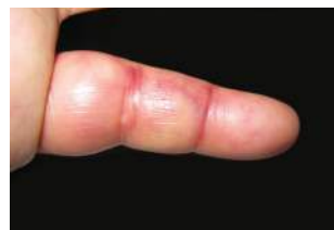
Finger fracture with swelling and bruising

Fractures can cause pain, throbbing, swelling and bruising, and the finger might look deformed or out of place. There will also be limited motion or inability to move the fractured finger and also the other