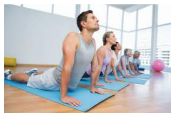
Yoga poses may be painful when a ganglion cyst is on the wrist

The ganglion cyst usually appears as a bump that changes size. The cyst may appear over time or appear suddenly. It may get smaller in size and even go away and come back at another time. A