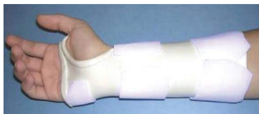
Custom-made orthosis to limit motion in a wrist with a ganglion cyst

A hand therapist will help determine which activities should be avoided. A hand therapist may also make a custom orthosis to limit joint motion. If surgery is performed, treatment will include exercises to restore the range of motion, strength and function of the hand. Other treatments may also be used to help manage pain and scarring.