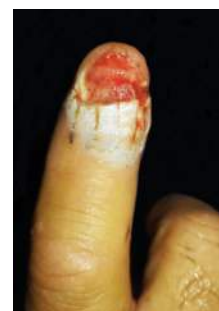
A fingertip injury showing damage to the nail

Fingertip injuries can cause bleeding, bruising and swelling. There may also be decreased feeling and a change to the shape of the finger. Some fingertip injuries may develop an infection. Due to nerve endings on the tip of the finger, these injuries may be painful and sensitive when touched.