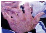
Example of a lateral PIP dislocation after a motorcycle injury

A dislocated finger is usually obvious, but not always. The finger may appear crooked or bent and can be painful, swollen, bruised and difficult to move. There may be numbness or