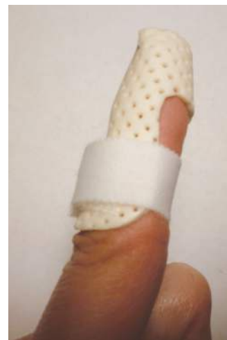
Example of orthosis for “Mallet Finger”

A hand therapist provides specialized care including non-operative and post-surgical treatment for extensor tendon injuries. A specialized hand therapy program may include a custom-made orthosis, and therapeutic exercises to restore motion and function of the hand. The physician, hand therapist and patient work together as a team in order to achieve the best possible outcomes after an extensor tendon injury.