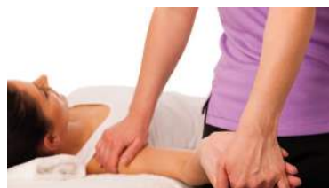
A therapist stretching the elbow to improve motion.

forceful activities, such as heavy lifting.