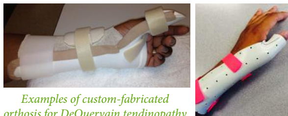
Examples of custom-fabricated orthosis for DeQuervain tendinopathy

A hand therapist can provide conservative treatment for DeQuervain tendinopathy. The therapist can help the patient determine which activities aggravate the symptoms and help with activity modification. The therapist may recommend a custom-fabricated orthosis, for the wrist and thumb to provide rest for the injured tissues. Following surgery, hand therapy is important to restore range of motion and return the patient to full activity.