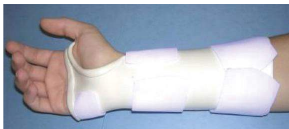
Example of orthosis for carpal tunnel syndrome

A hand therapist can help reduce the symptoms of CTS by first performing a complete evaluation to determine the main cause of the problem. He or she might recommend wearing a brace at night to keep the wrist in a safe position, or during the day for activities that might irritate the nerve. A hand therapist can provide patient education and recommendations for modifications to reduce symptoms during activities of daily living, work tasks and recreational activities. A hand therapist may also prescribe specific exercises to help in the recovery or prevention of future CTS occurrences.