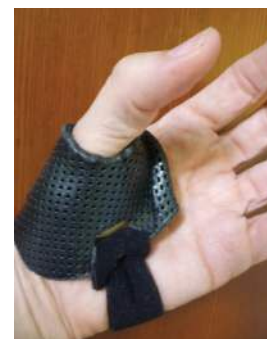
Orthosis for basal joint arthritis

Initially, a hand therapist can provide patient education including use of adaptive equipment, activity modification and special exercises to help reduce pain. A hand therapist can also provide a custom-fabricated brace or orthosis that will allow the thumb joint to rest and will provide support while performing daily activities. Hand therapy following surgery improves range of motion, and teaches the patient how to regain the function of the hand.