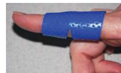
Example of custom finger orthosis for boutonniere deformity

For a boutonniere deformity that does not require surgery, a hand therapist will make a custom orthosis to place the finger in a proper position for correct healing. The therapist will also instruct the person in techniques to reduce swelling in the finger. The person must use the orthosis as instructed in order to achieve a good outcome. For injuries requiring surgery, the hand therapist will make an orthosis after surgery and instruct the patient in management of the scar. The hand therapist will also instruct the person in a specialized home exercise program that will assist with return to normal hand function.