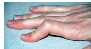
Index finger boutonniere deformity showing bent PIP joint and a straight DIP joint

There will also be swelling and discomfort. In a boutonniere that has gone untreated, the finger may become stiff, making it difficult to straighten the finger at all.